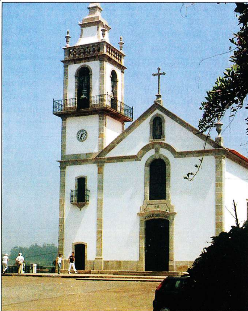
The Church of St Eulalia