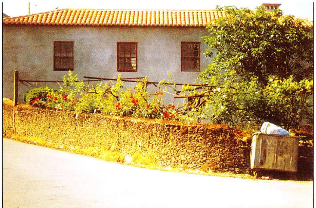
The home of Blessed Alexandrina today. The window from which she jumped is covered by the tree

Alexandrina went into her first ecstasy in 1931 when she heard Jesus say to her, "Love, suffer and make reparation." As she grew more and more in holiness she offered herself to